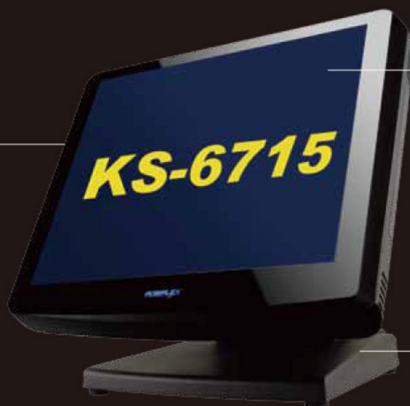
Resistive or IR touch screen : 15" LCD