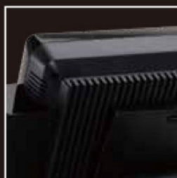
Patent aluminum die casting design