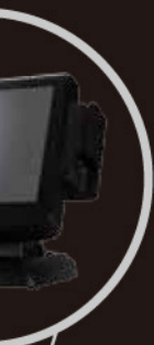
and finger lever